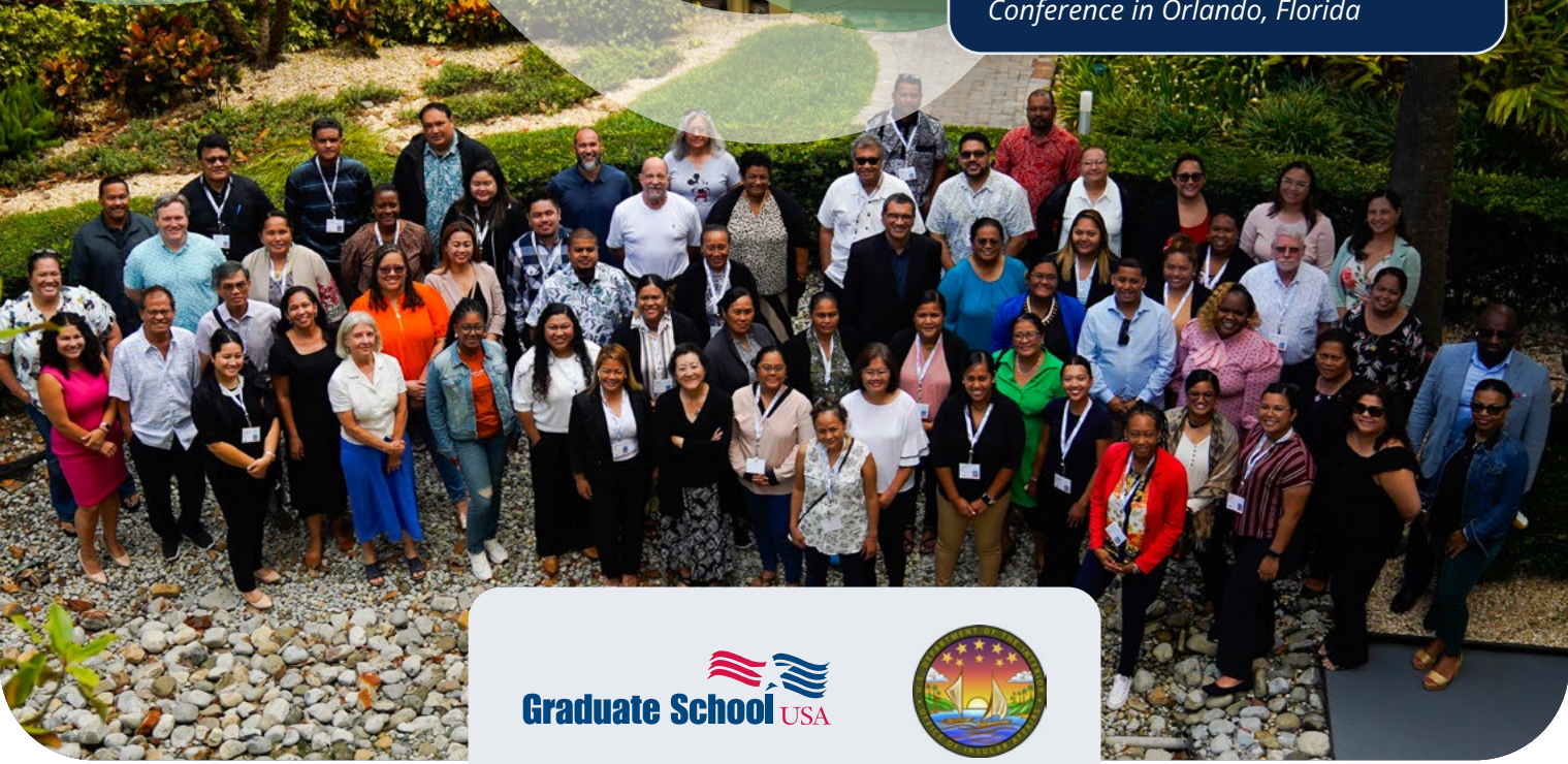
Participants of the 2024 IGFOA Summer Conference in Orlando, Florida

Waikiki Beach Marriott Resort & Spa 2552 Kalakaua Avenue, Honolulu, Hawaii 96815 December 10-12, 2024