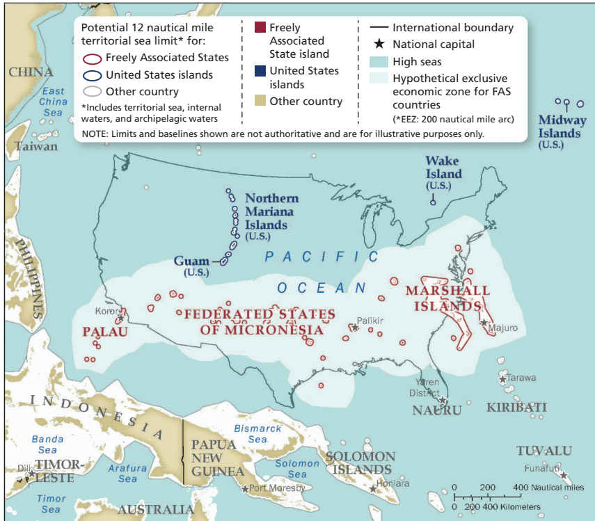
Figure 1.1 Map of the Freely Associated States