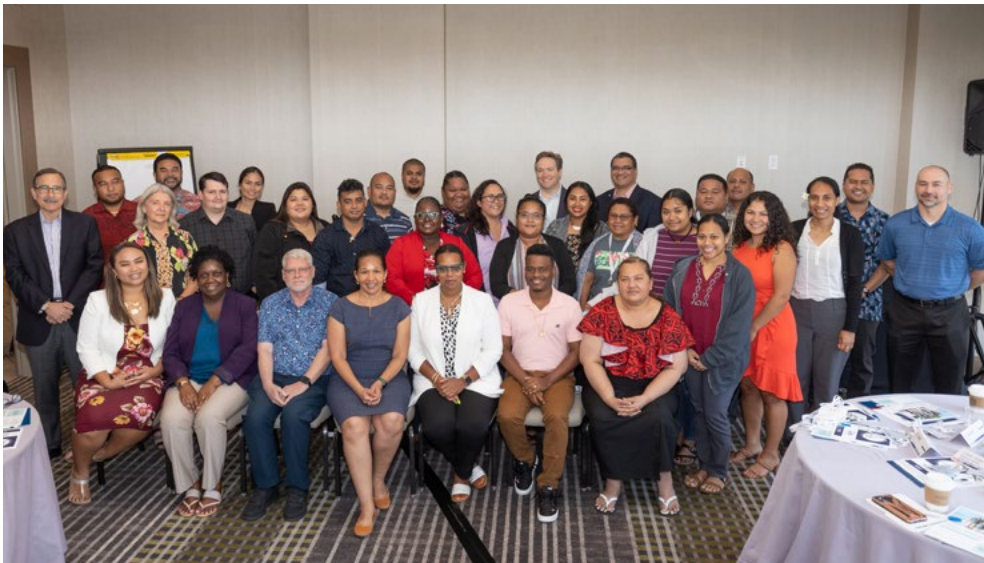
IGFOA Summer 2022 Conference, Austin, Texas