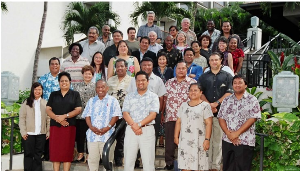
IGFOA 2004 Winter Conference, Maui, Hawaii