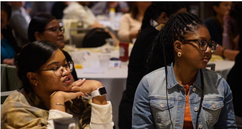
Palau and USVI participants at the 2024 IGFOA Summer Meeting