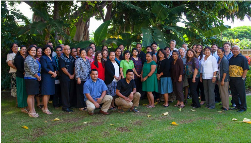
IGFOA 2014 Winter Conference, Maui, Hawaii