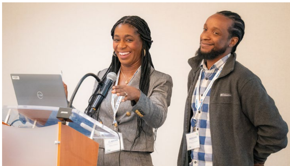
USVI participants present their action plans at the 2023 IGFOA Winter Meeting