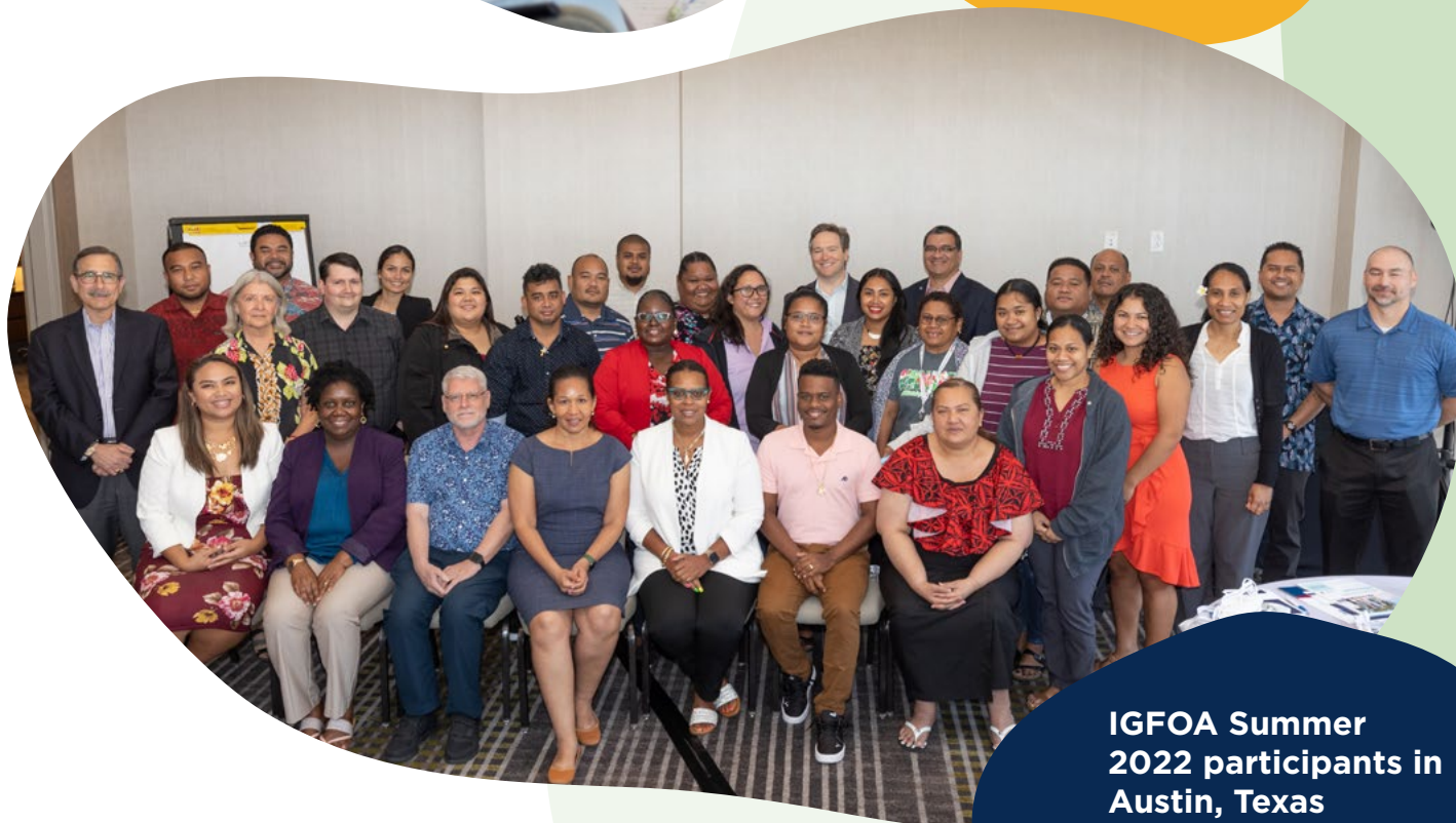
IGFOA Summer 2022 participants in Austin, Texas