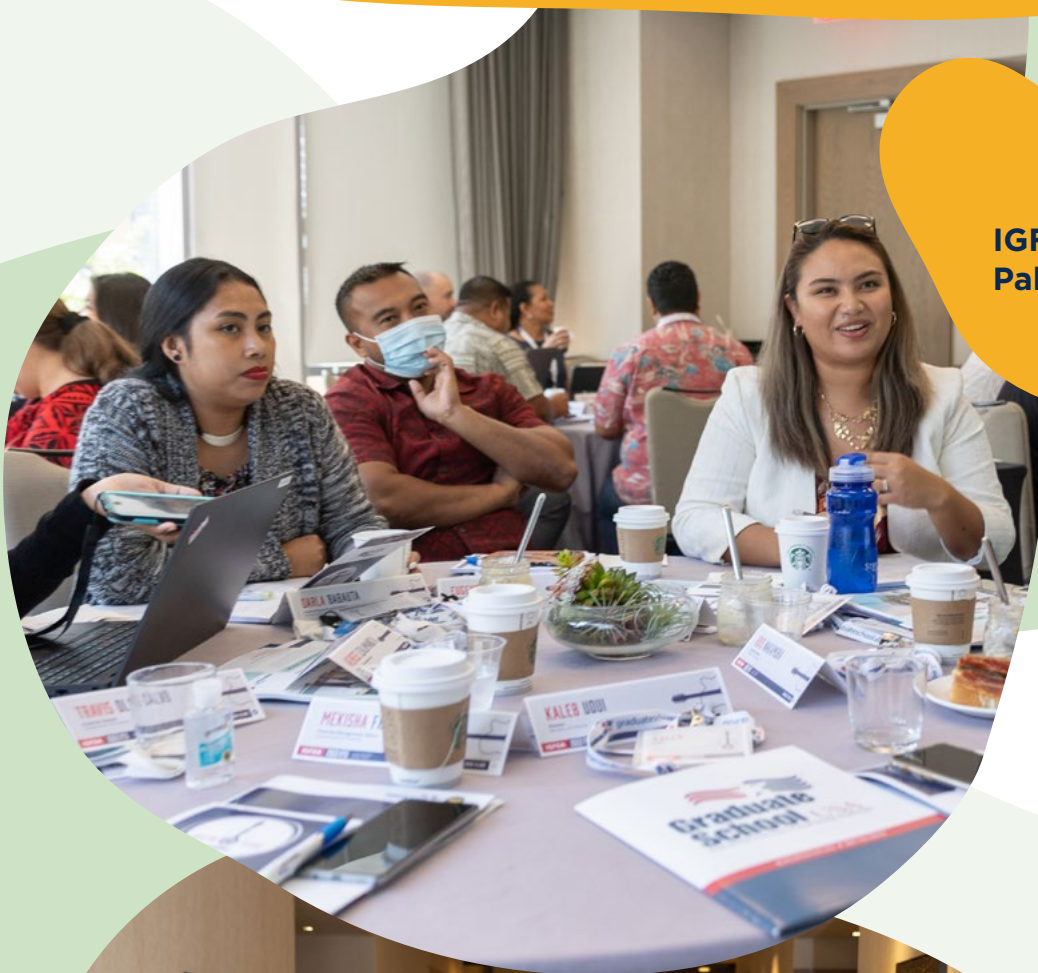
IGFOA participants from Palau, FSM and CNMI