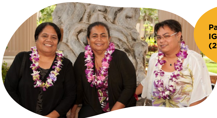
Participants at IGFOA Kauai (2012)