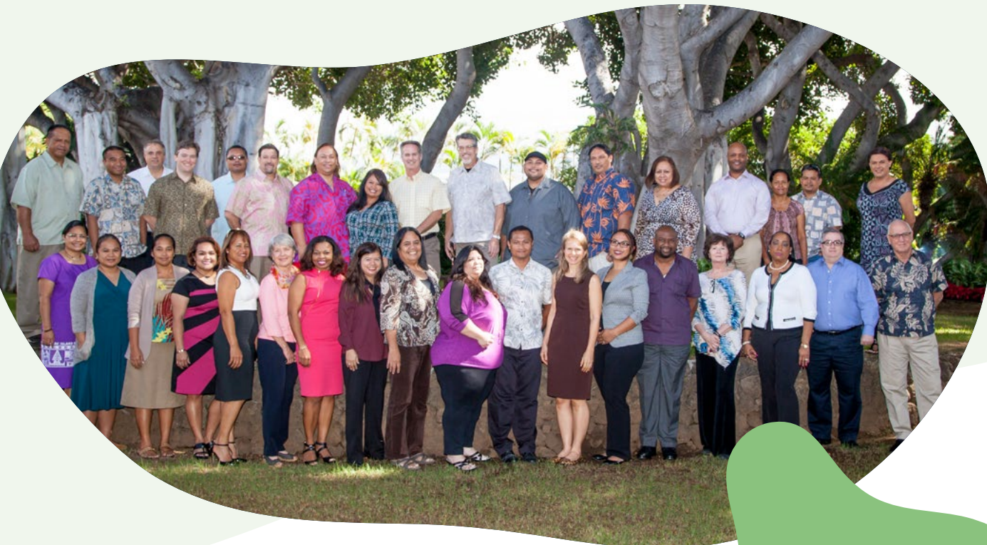
IGFOA 2015 (Maui)