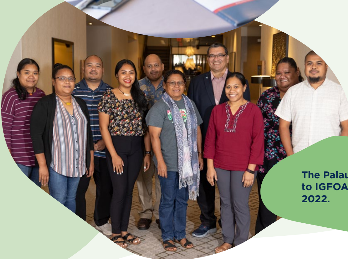
The Palau delegation to IGFOA Summer 2022.