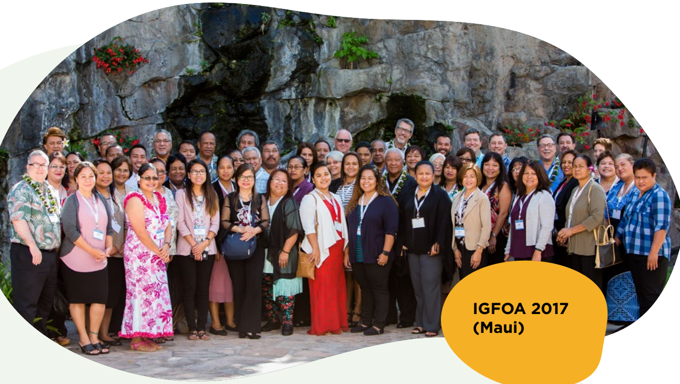
IGFOA 2017 (Maui)