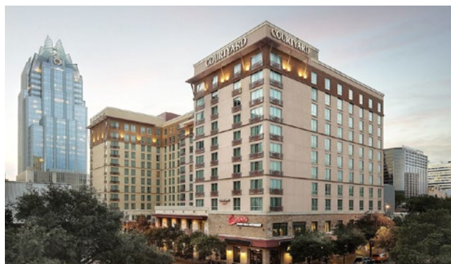
Residence Inn by Marriott Austin Downtown/ Convention Center