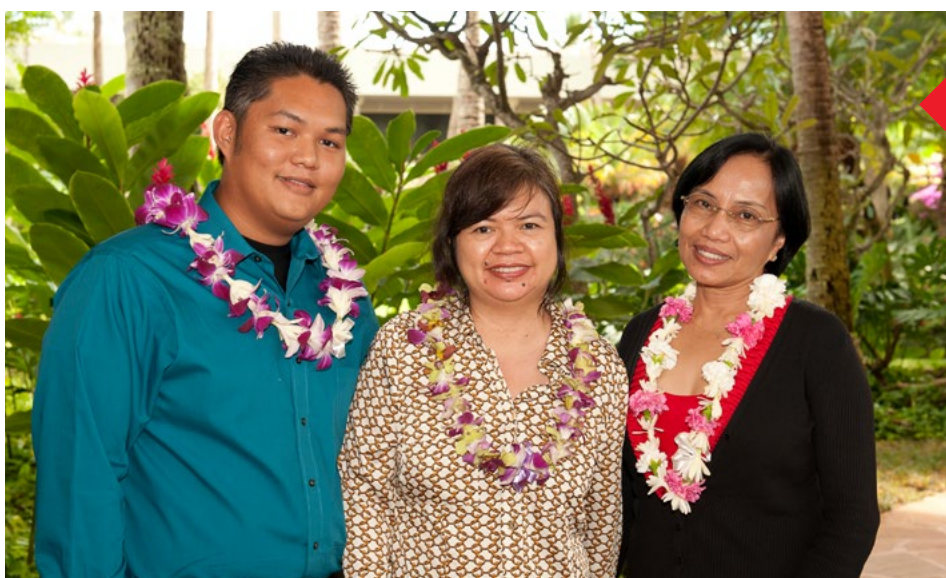
Participants at the IGFOA Winter Meeting Kauai.