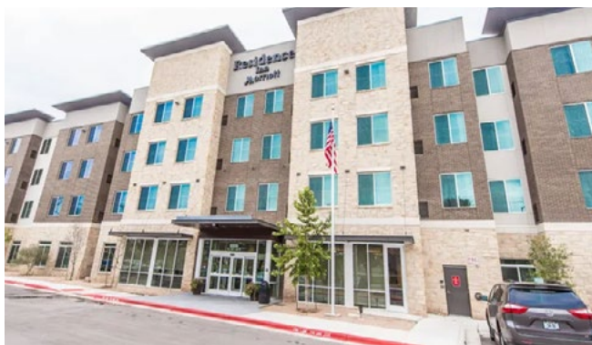
Courtyard by Marriott Austin Downtown/ Convention Center