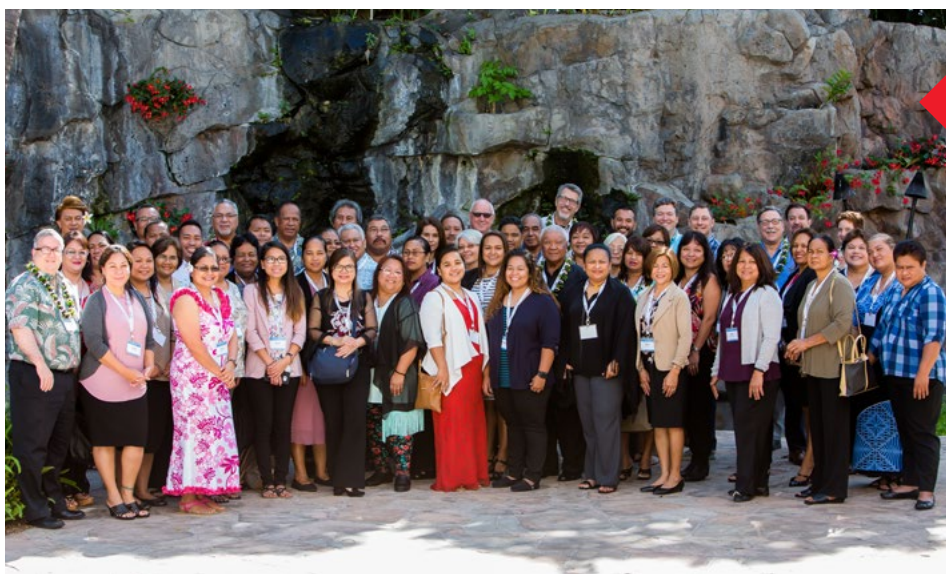
Representatives from insular governments in the Pacific and Virgin Islands joined together at the IGFOA Winter Meeting in Maui.