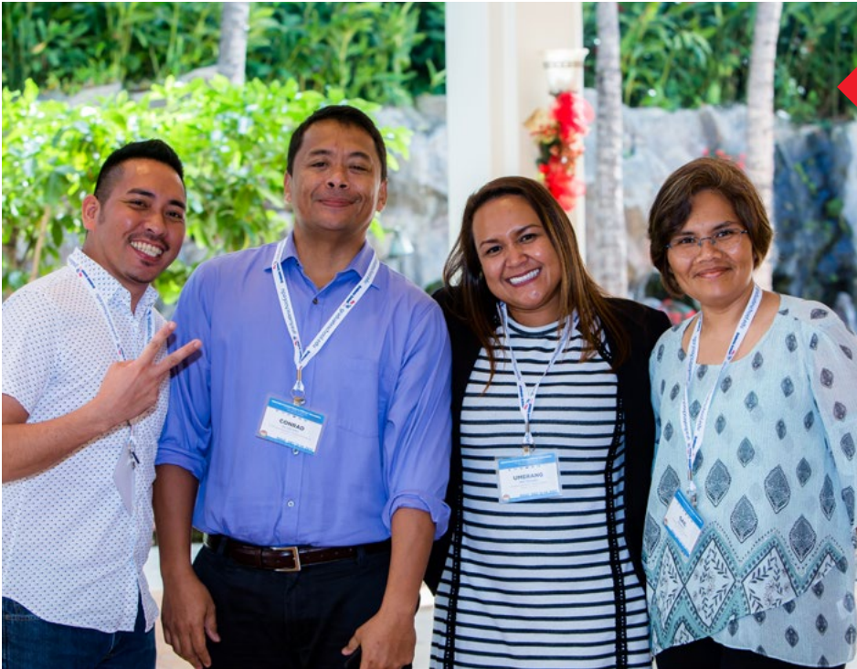
Palau delegation at the 2017 summer IGFOA meeting in Maui.